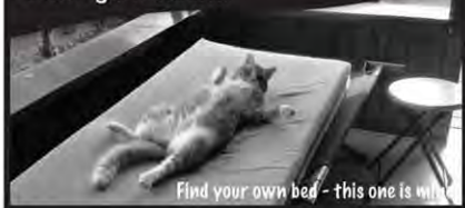
Find your own bed - this one is mine

"Yesterday I was clever, so I wanted to change the world. Today I am wise, so I am changing myself." - Rumi