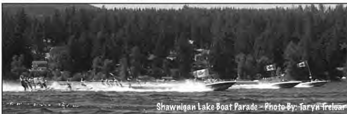
Shawnigan Lake Boat Parade - Photo By: Taryn Treloar