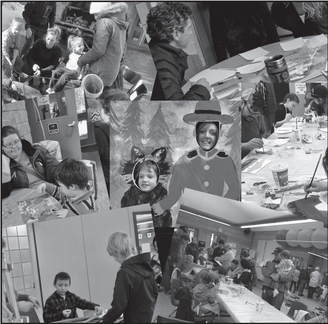
The 2017 Family Day event sponsored by the Shawnigan Lake Museum was lots of fun for families. Visit the museum to see the great art projects on display. Thanks to all of the wonderful volunteers! We acknowledge the financial support of the Province of BC

coming weeks is to ask anyone going out for a hike/walk/ride in any of our local parks or trails to please pack a folding saw, pruners or anything that can help clean up the windfall from the numerous storms that have passed by this winter. Our CVRD park employees are out tending to major issues, but any help with smaller debris would be much appreciated. The next meeting is Thursday, March 16th at 7pm at the Shawnigan Lake Community Centre.