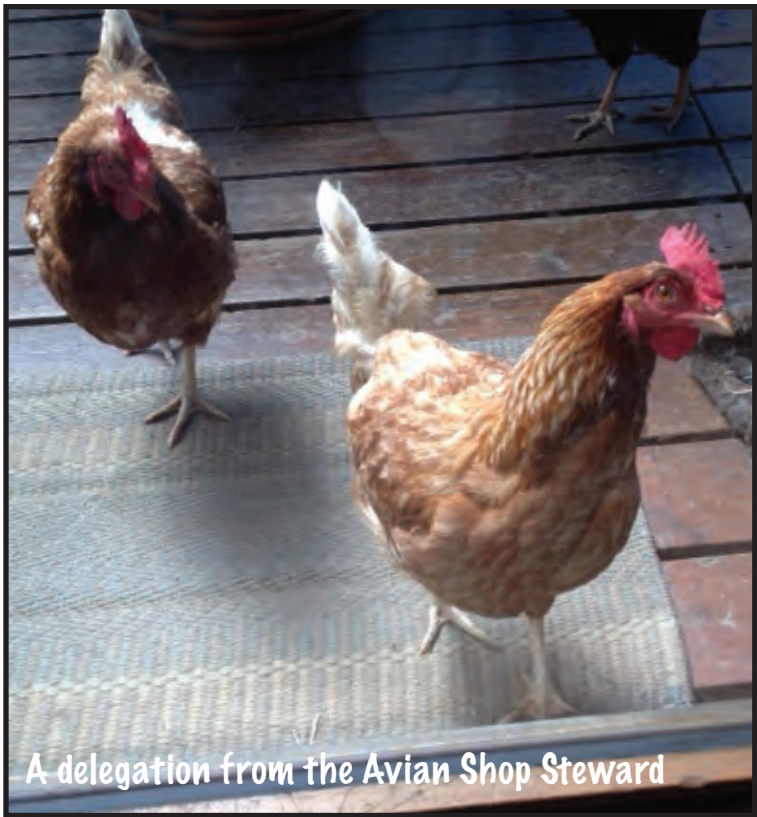
A delegation from the Avian Shop Steward