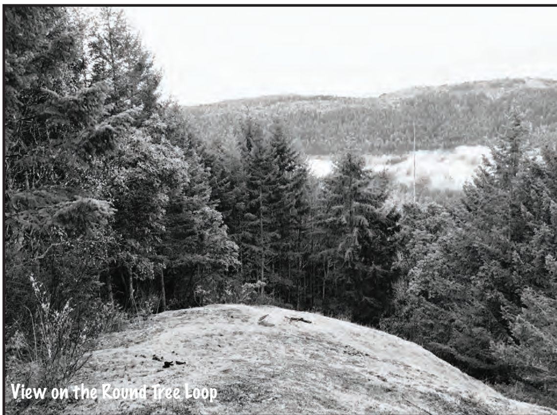
View on the Round Tree Loop

We will conclude with a little history about Gowlland Tod Provincial Park from the BC Park website: "The long history of settlement on Finlayson Arm is evident from many archaeological village and midden sites found in the park. There is continuing importance