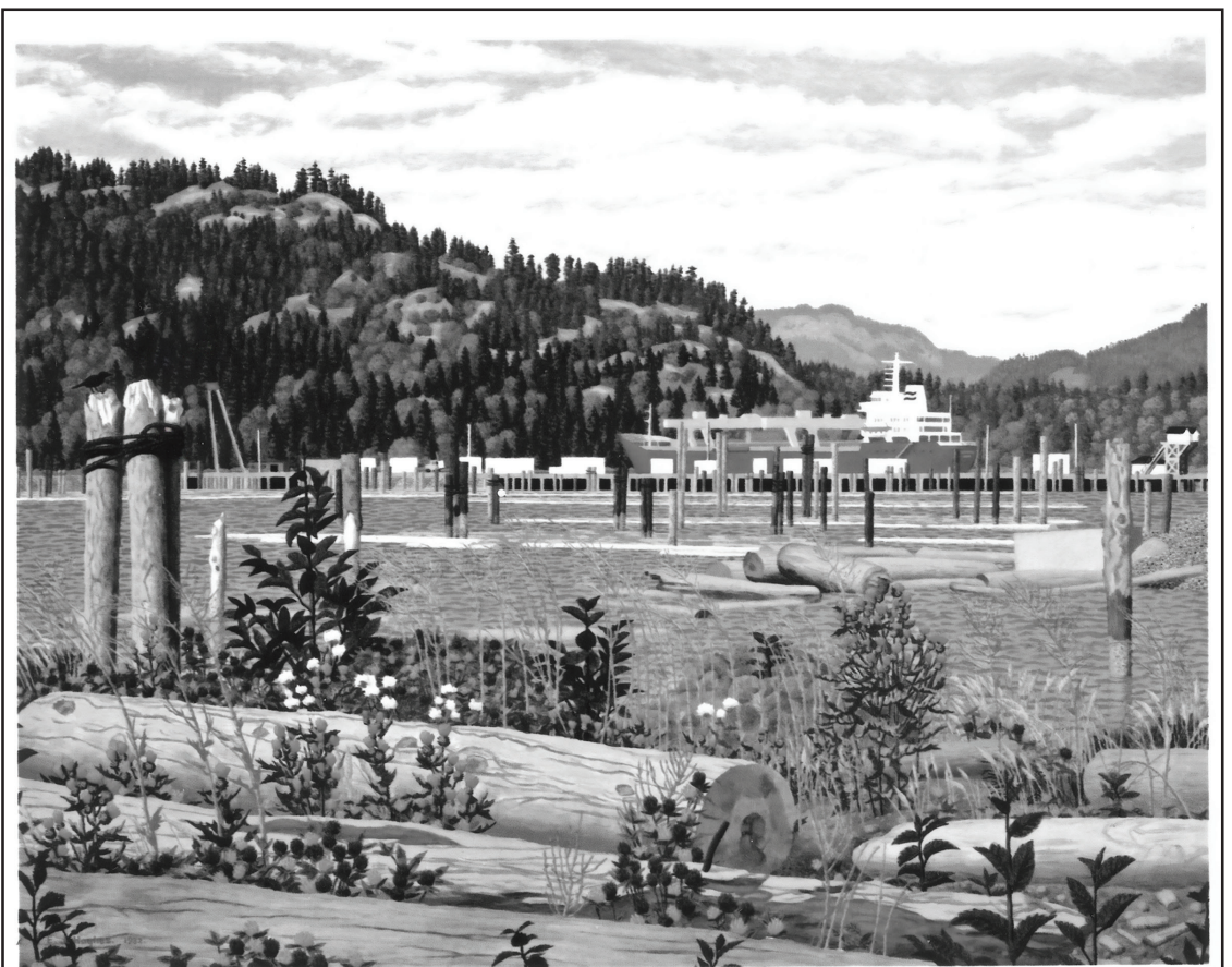
E. J. Hughes Ship with a Blue Hull, Cowichan Bay, 1982. 32"