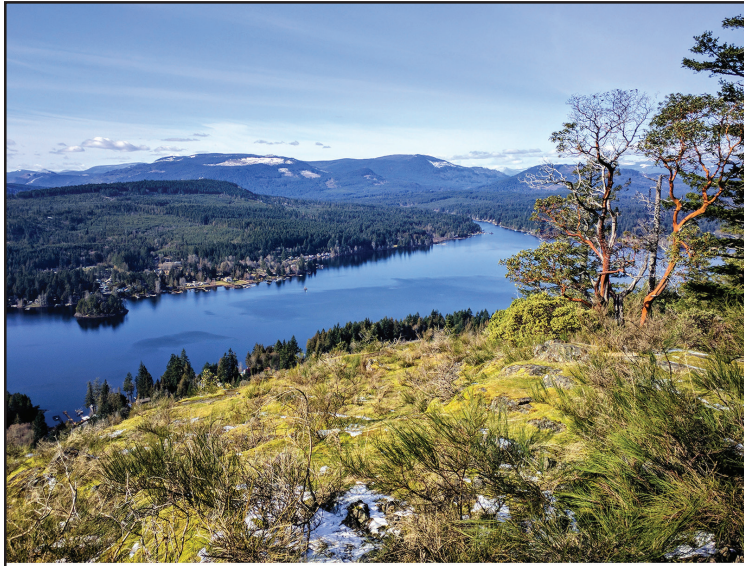
Keep it Beautiful

This month we are celebrating 3 years as Canada's first Rotary club dedicated to environmental