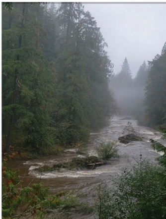
Xwulqw'selu Sta'lo' (Koksilah River). October 19 & 20, 2024