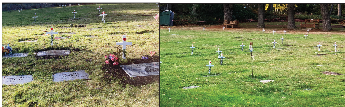
Shawnigan Cemetery recognition of local veterans