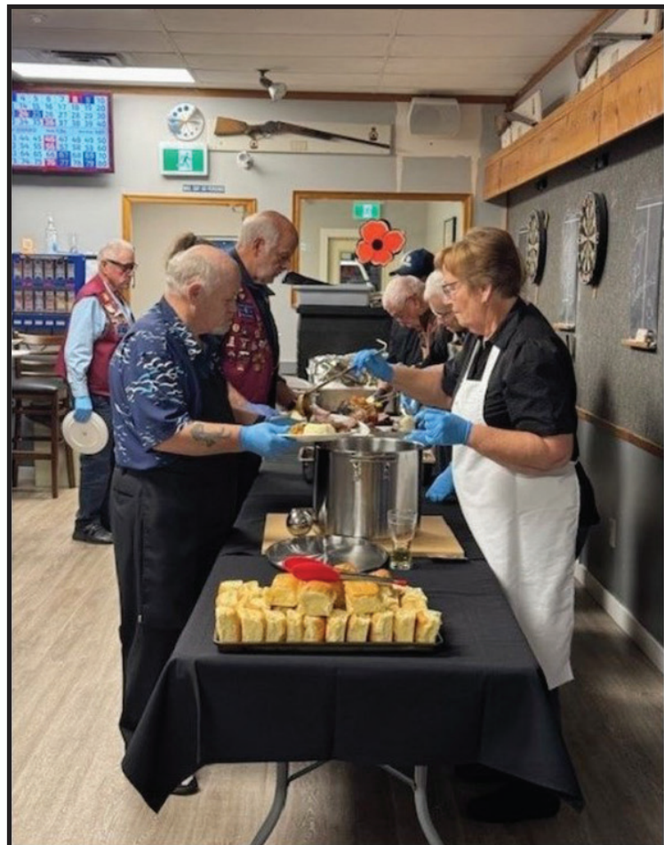
South Cowichan Seniors Serving

The South Cowichan Seniors Group, a community organization acclaimed for its exceptional catering services, expertly prepared the scrumptious dinner complete with cake dessert. Known for their large-scale culinary endeavors, this dedicated group typically provides hot lunches for up to 130